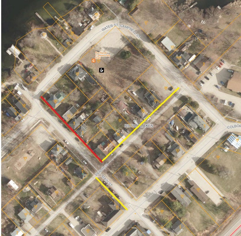
Map of Newboro (Yellow = Sidewalk to be Replaced)