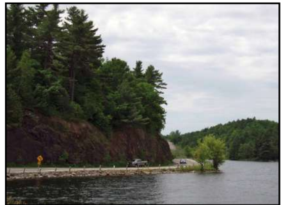
The road clings to the cliffs along the shore of Wolfe Lake

Km. 96.2 (44° 37.260'N. 76°23.682'W.) Before you get to Bedford Mills, turn left (easterly) onto Hutchings Rd. toward Newboro