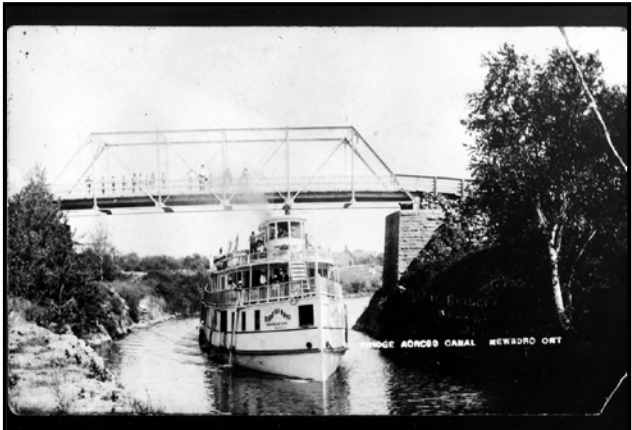
Rideau Queen in the Newboro Channel. From here, the only way is down to Ottawa or Kingston.

Option: Explore Westport to find a wide variety of services and shops, including a bakery. Arena and Art Festival, music festivals, several churches. Public Washrooms at Info Centre (in season)