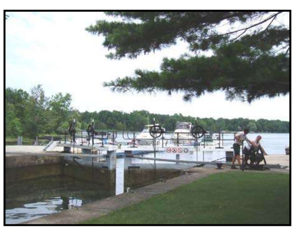
Opening the gate at Narrows Lock into the realm of Big Rideau Lake

Here, you are also crossing the Rideau Lakes Fault Line, especially evident in the cliffed north shore of the Upper Rideau between the Canadian Shield to your north and the St. Lawrence plain to your south.