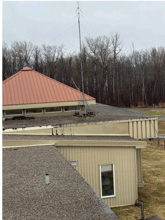
VIEW OF BALLASTED ANTENNA TO BE REMOVED & DISPOSED