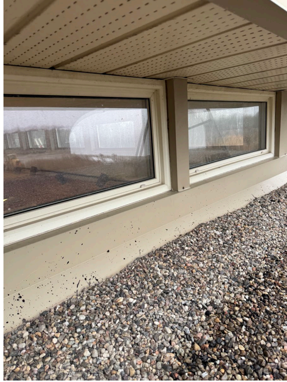
VIEW OF WINDOWS ON CLEAR STORY TO BE CAULKED