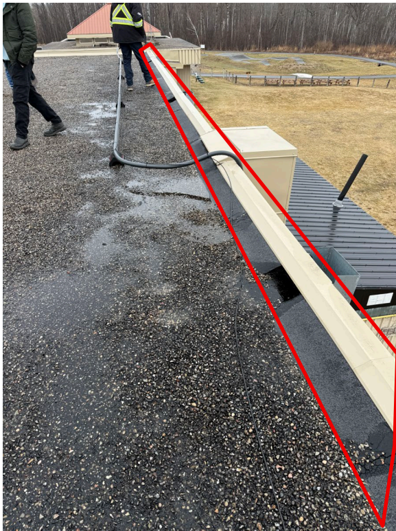
VIEW OF ROOF EDGE TO BE REPAIRED