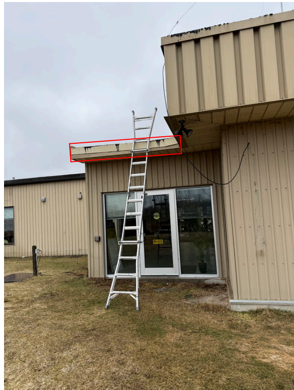
VIEW OF ROOF EDGE TO RECEIVE NEW EAVESTROUGH AND DOWNSPOUT