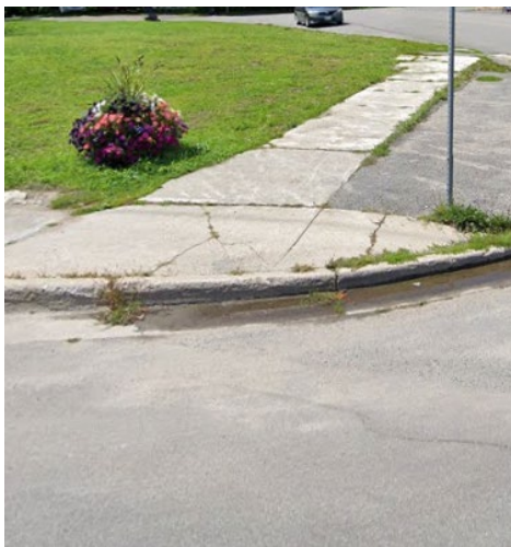
Lower Beverley and King Street