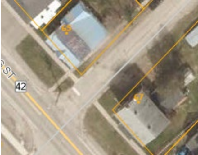
King and William Streets