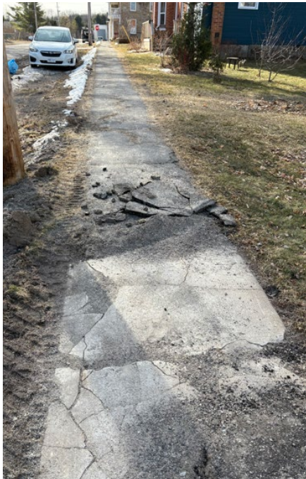
Main Street Portland