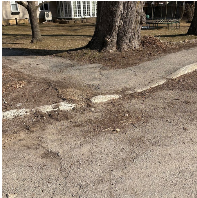
Corner of St. Mary Street, Portland