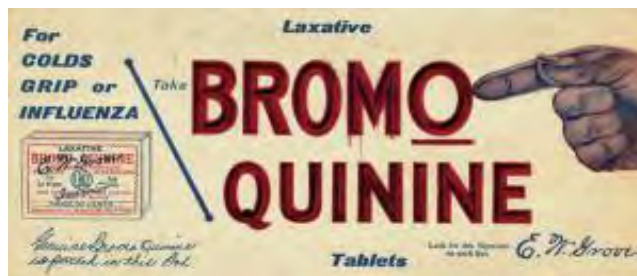
An ad for Bromo-Quinine tablets, circa 1919. They were advertised for use with colds and influenza. They contained yellow phenolphthalein, a cathartic, which was inaccurately believed to help flush disease out of the body.

"My father told us this story when we asked why he was not eating the blueberry dessert. In 1918, when he was 7 years old, the so-called Spanish flu invaded the region and their farm home. There were seven children, ranging in age from ten to one. Everyone except his father was infected. My Dad said they were all terribly sick and my grandfather was nurse to my grandmother and the children. I should mention that my grandmother was made of steel and the fact that she was flat on her back indicates how sick they were! Once a day Grandpa had to give them all a dose of terrible tasting medicine. Imagine trying to get small children to swallow that! Apparently, he was at his wits end when he hit upon the idea of trying to mask the taste with blueberry preserves. It didn't help much because the children knew what was in the concoction. However, he was able to persuade them to take it. My father vowed never to eat another blueberry and he did, not ever"