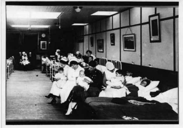
Caring for influenza patients at the Great War Veterans' Association Emergency Hospital on Princess Street.