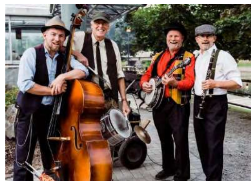
King of the Swingers