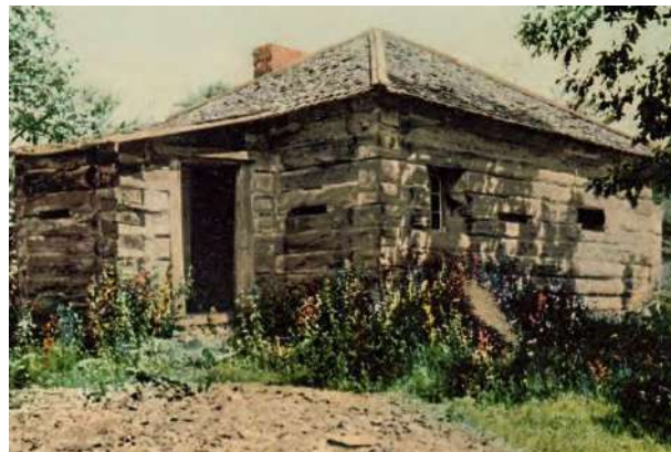
Old Block House near Jones Falls