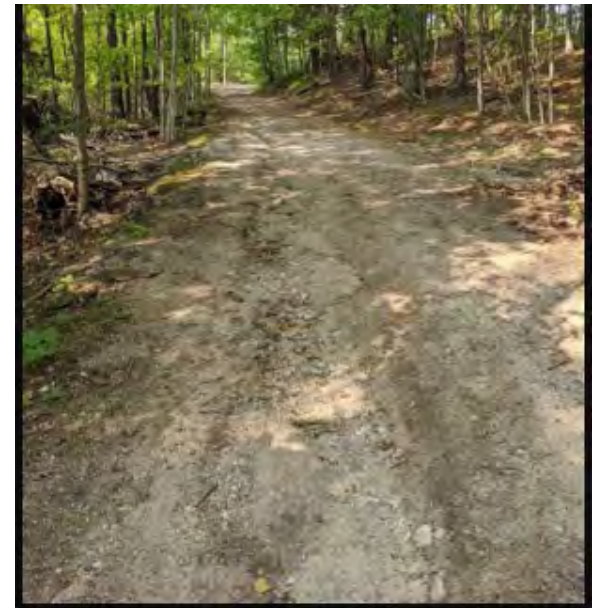
Photo 3: This is an example of a road which was given a 2 out of 5 as it was in need of repair along most of the road.