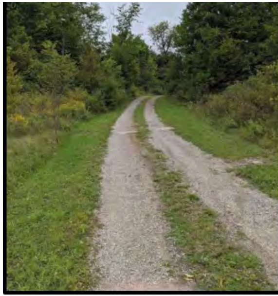
Photo 2: This is an example of a road which was given a 3 out of 5 as some parts were in need of repair, but the road was easily drivable.