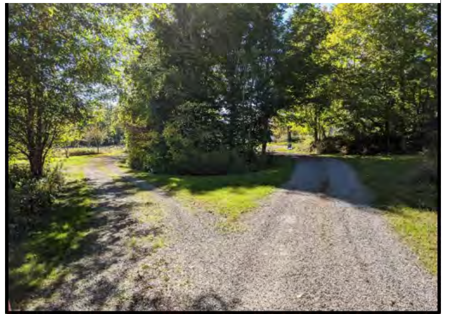
Photo 5: This is an example of a looped turnaround and does not require reversing at the end of the private road.