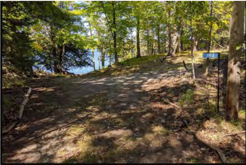
Photo 4: This shows a turnaround which is within a private driveway but had adequate and appropriate room for a turnaround. This would be labelled as ___/Other within the spreadsheet depending on what the turnaround is made from.