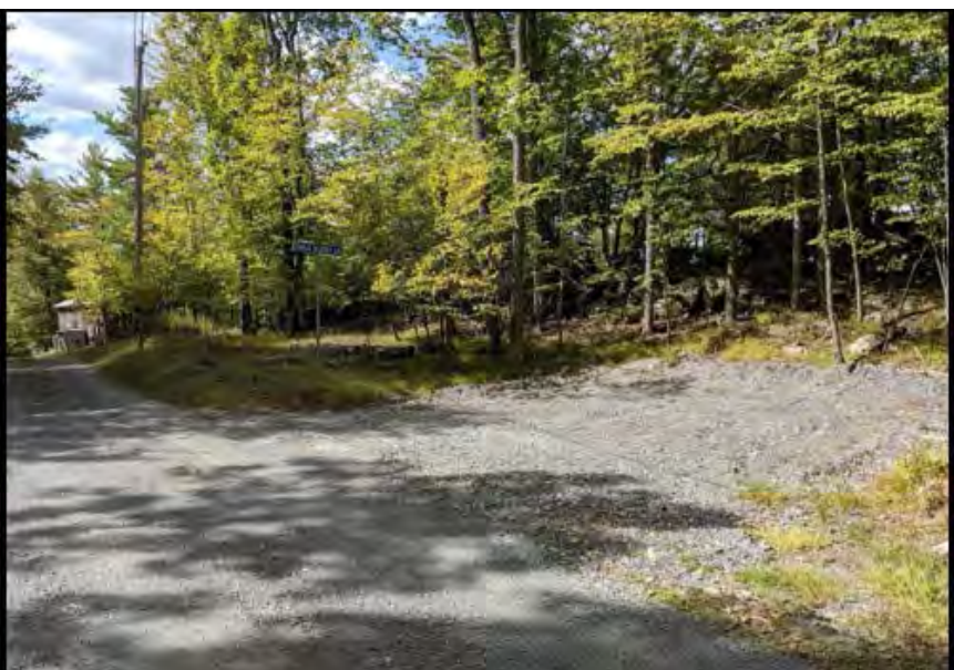
Photo 6: This photo shows an adequate, and in this case 'gravel' turnaround at the end of a private road, which is a part of the road itself and not within a private driveway.